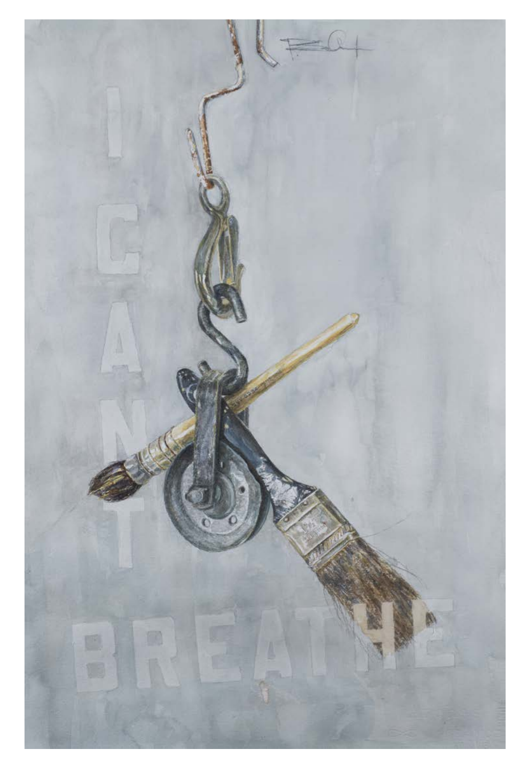
State of Affairs, 2021, watercolor on paper, 21" X 14"