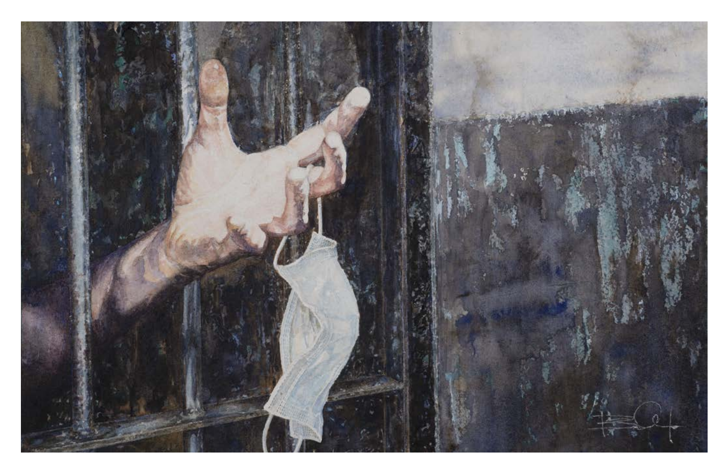
Have Mercy on Us, 2020, watercolor on paper, 13"X 201/4"